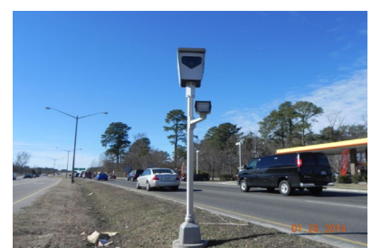
Portsmouth Blvd. Left Turn Lane