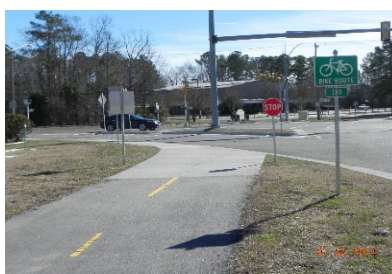
Gum Road Bike Path