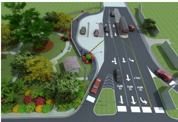
Entry Gates - rendering

Rodriguez Field Parking Lot, JEB Little Creek, Virginia Beach, VA - Prepared site construction plans for an 80-space asphalt parking lot and new crosswalk. Pavement design per VDOT method, stormwater management facility design and initial cost estimating services included. Proof roll inspection of parking lot. Helped prepare RFP scope of work by providing 4 design alternatives.