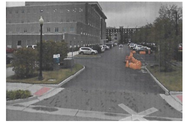
Norfolk Public Health Building